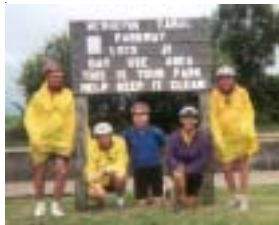
A break in the rain long enough for a smile and group photo on the Hennepin Canal.