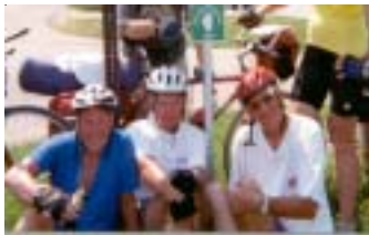
Three Trail Blazers take a break under a Grand Illinois Trail marker.

The Grand Illinois Trail Illinois Department of Natural Resources One Natural Resources Way Springfield, IL 62702-1271