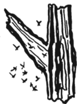
dead tree insect-eater