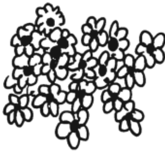
red flowers nectar-eater