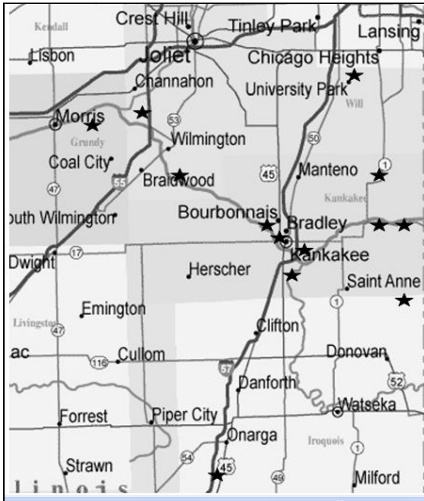
Figure 1. Stars indicate locations where red squirrels ( Tamiasciurus hudsonicus ) were live-trapped or observed during surveys conducted May-November, 2006.